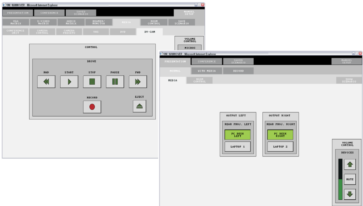
Fig. 4. Left: MANUAL SETUP, right: PRESENTATION sub tree NORMAL

To enhance the flexibility of iL2 we installed wireless