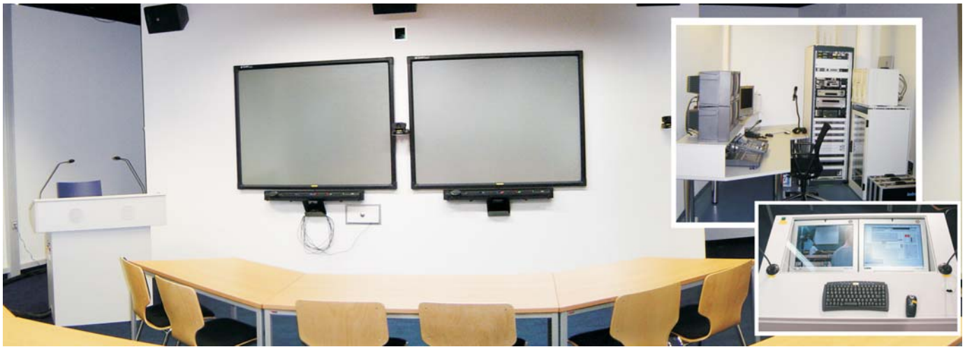
Fig. 1. iL2 overview, more pictures can be found in [5]

Implementing easy to use equipment usually means that the user is only permitted to affect few parameters and the flexibility of the devices is limited in favour of lucidity. Because this is in contrast to the philosophy of a laboratory, satisfying the demands of both target groups in one room is not an easy task. One solution for this problem is to install a laboratory and use operational staff to support non-technician users. At L3s, this was out of the question because extra money for additional operational staff was not budgeted. To be able to operate an additional multimedia room at L3S with the existing staff, the concept for iL2 had to comply with the requirements mentioned above and reduce time exposure for operation and support concurrently.